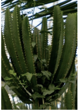
(7) Candelabra Plant