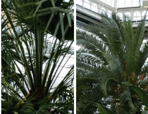
(1) Chamaerops Humililis