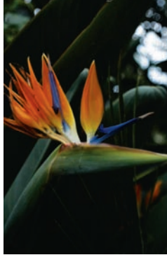
(10) Bird of Paradise